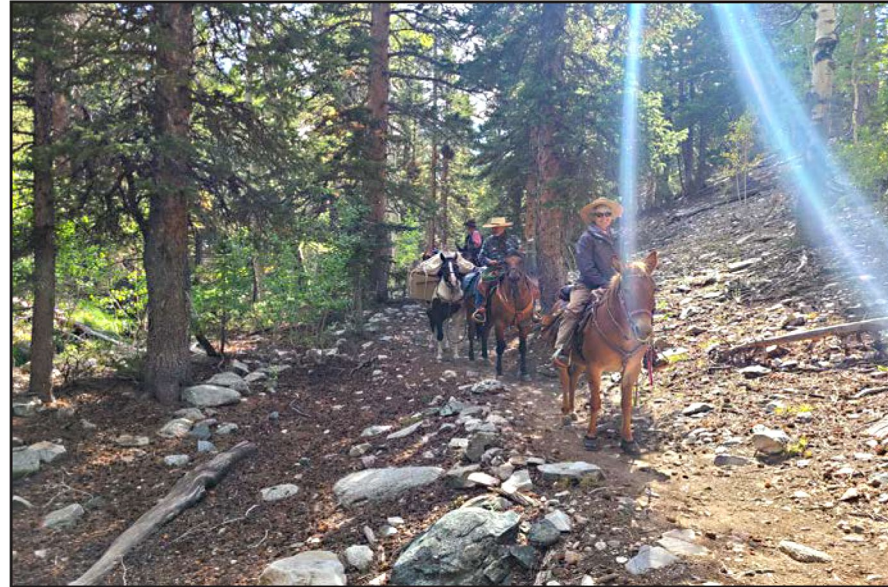
The Backcountry Horsemen of Nevada - High Desert Chapter were instrumental in helping get gear to and from Baker Lake.

The water level at Baker Lake varies throughout the year with the highest lake volume occurring in the spring following snow melt and the lowest levels in the late summer and fall, depending on seasonal precipitation and the persistence of the previous year's snowpack. Calculating Baker Lake's volume at the time of the treatment was a necessary step to determine the amount of piscicide needed to effectively treat the lake.