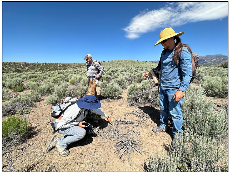
NV Division of Natural Heritage, ENLC and BLM Staff "botanizing" during BARNM BioBlitz

Collaborating with the Bureau of Land Management on the two-day BioBlitz were the U.S. Geological Survey, Nevada Department of Wildlife, and Nevada Division of Natural Heritage. Other participants were the College of Southern Nevada, Conservation Lands Foundation, Friends of Basin and Range, and Eastern Nevada Landscape Coalition, which is working with the BLM and state wildlife agency on a five-year project to